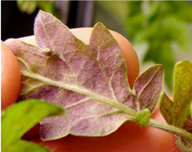
Phosphorus deficiency on tomato leaf.