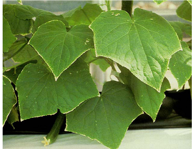
Potassium deficiency. http://aggie-horticulture.tamu.edu/vegetable/problem-solvers/cucurbit-problem-solver/leaf-disorders/potassium-deficiency/

Plants lacking potassium results in slow growth and vigor of plants. Symptoms include wilted older leaves and burnt leaf margins.